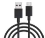
USB Type-C charging cable