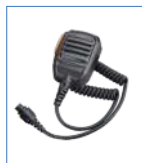
Wired Remote Speaker Microphone