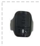
Wireless Ring PTT