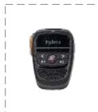
Wireless Remote Speaker Microphone