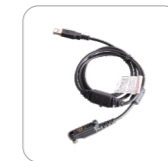
Programming Cable PC155