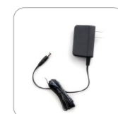
Power Adapter 12V/1A