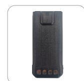
Li-ion Battery 1500mAh